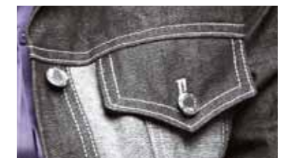
Topstitching on several layers of denim is simple when using the Original IDT™ System together with heavier thread and a topstitch needle.