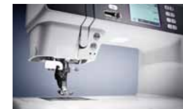
Three bright lights illuminate your entire sewing area without shadows. Two lights for ambition essential™ sewing machine.