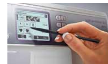
View your selections, options and stitch information on-screen with the highest resolution level. Navigating the touch screen (quilt ambition™2.0 sewing machine) is easy with the stylus.

4 alphabets and the many beautiful quilting stitches give you variety when composing your next quilted masterpiece. Two additional presser feet are included with the quilt ambition™2.0 sewing machine to further increase your quilting experience. (Open toe free-motion foot and ¼ inch quilting foot for IDT™ System.) Discover the convenience of the Bobbin thread sensor which clearly indicates when the bobbin is running low.