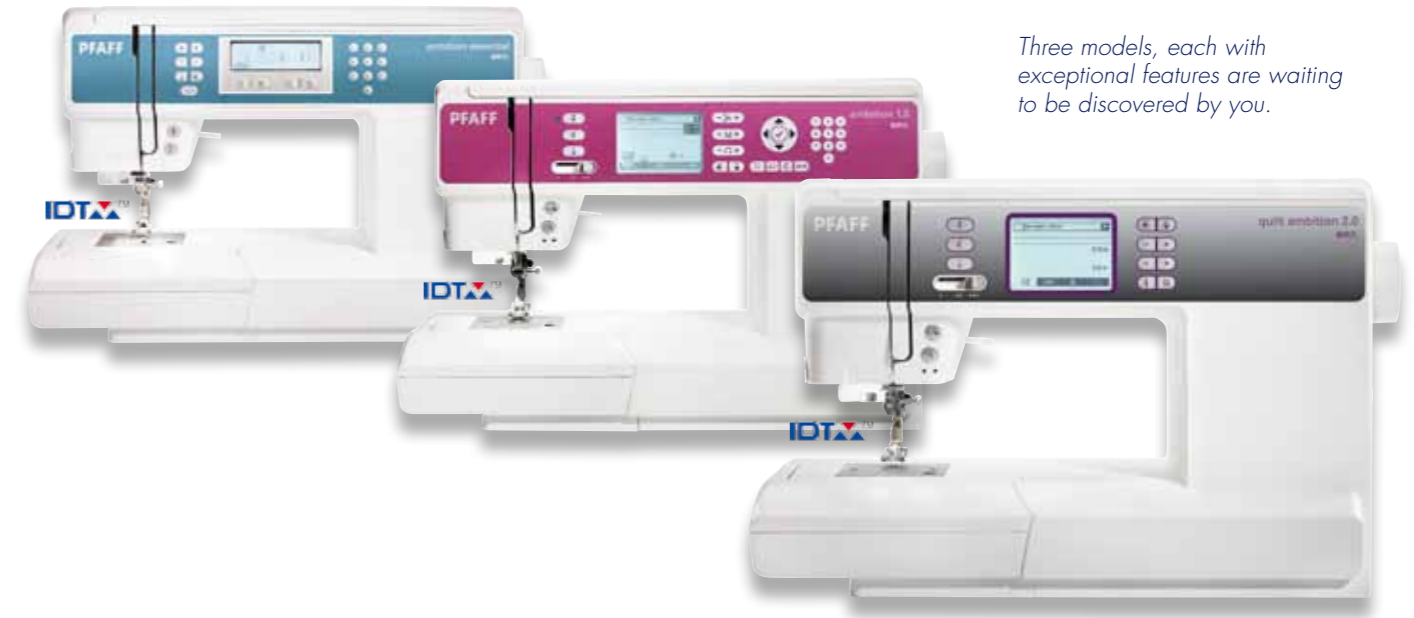
Three models, each with exceptional features are waiting to be discovered by you.

MAKE THE COMPARISON. DISCOVER THE DIFFERENCE.